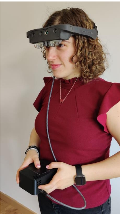
Figure 2: UC7 User Equipment at the UMA testbed

The experiment was carefully planned to ensure comprehensive evaluation of the UC7 objectives on the UMA testbed. The hardware setup consists of an AR visor connected via a USB cable to the main computing unit, housing the 5G Quectel modem (Figure 2). Researchers wore this setup in the campus zone with direct visibility to the antennas. Users can communicate with the remote C&C Centre through audio-video communication, with video streamed from the wearable camera to the visor and onward to the C&C Centre, while audio is established during the video call.